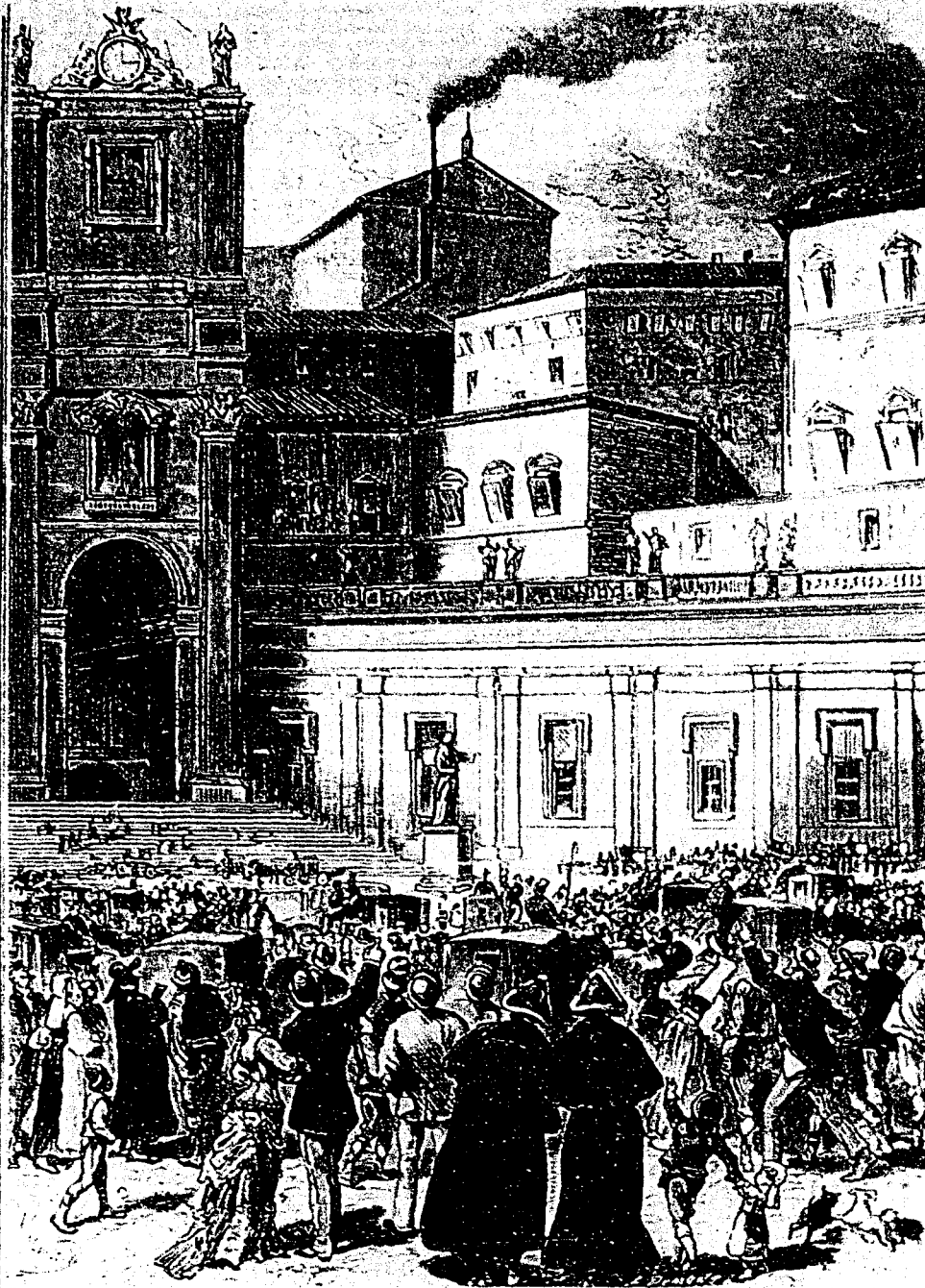
OBSERVING THE "SPUMATA" IN ST. PETER'S SQUARE DURING THE SITTING OF THE CONCLAVE

NORTON'S CAMOMILE PILLS, LONDON. 16-5-52-28