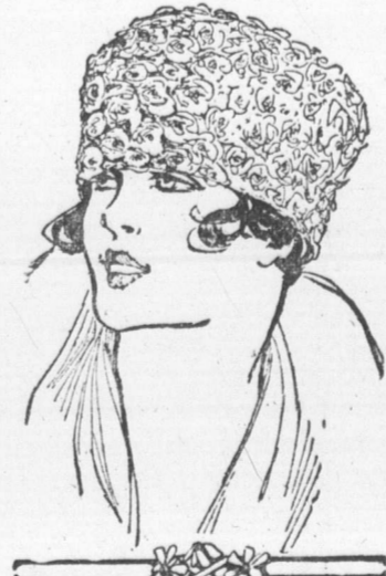
Floral toque covered with dull pink Banksia roses. A thing of beauty and a great relief from the dark gray days.

For Correct Combination. The correct thing to combine with such a toque as this is a large square