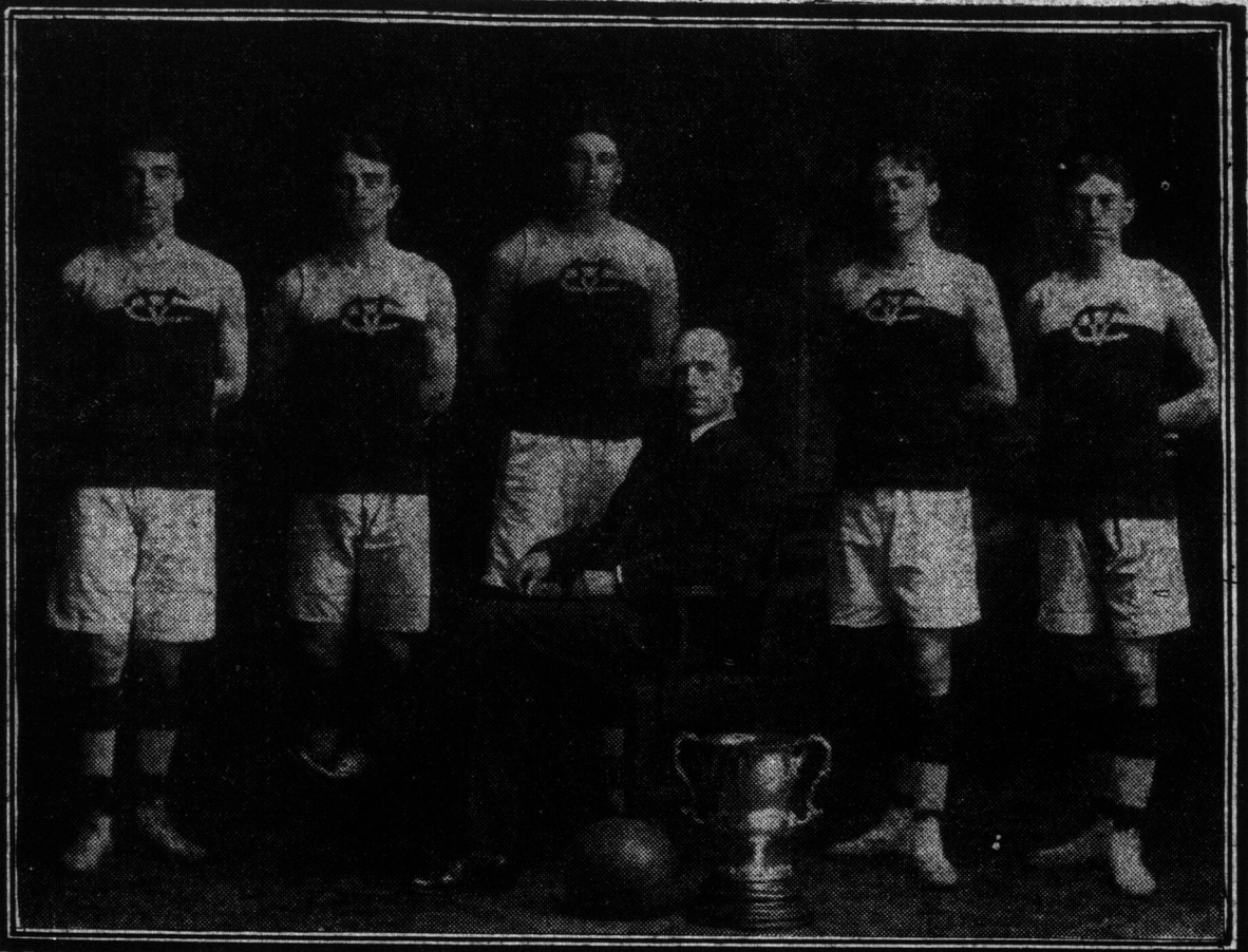
VICTORIA HIGH SCHOOL BASKET BALL CLUB INTER-SCHOLASTIC CHAMPIONS OF BRITISH COLUMBIA

The personnel of the different High School championship teams as depicted in the accompanying pictures is as follows: