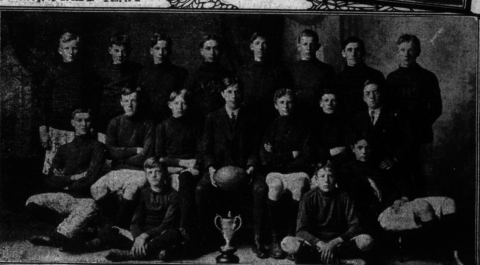
VICTORIA HIGH SCHOOL RUGBY CLUB JUNIOR CHAMPIONS OF VICTORIA, B.C.