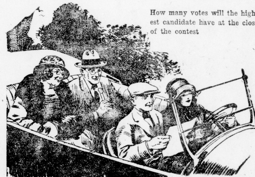
How many votes will the highest candidate have at the close of the contest

This Ford Touring Car or $500 in Cash will be given to the subscriber who guesses the correct or nearest correct number of votes that the highest candidate will have at the close of the contest. One guess will be allowed for each dollar paid in on subscription, whether it is given to some candidate or mailed direct to The London Advertiser.