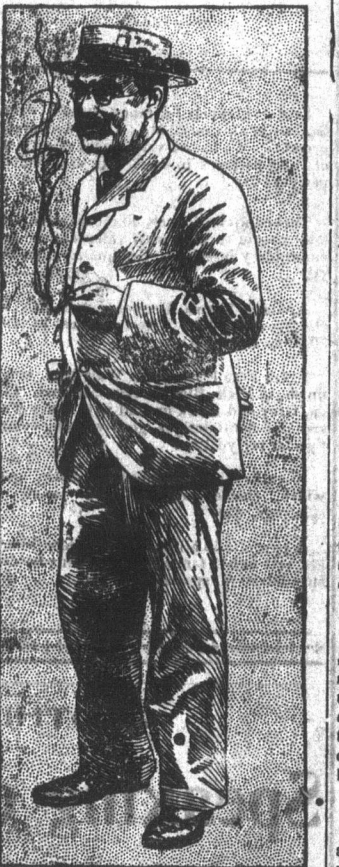
RUDYARD KIPLING'S LATEST PICTURE. Literary events of the year, reveals the disconcerting evidence that Kipling's trousers bag at the knees. O tempora! O mores! O poetic pants!

The latest picture taken of Rudyard Kipling, whose new book, "The Five Nations," published a few weeks past, is considered one of the great