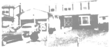
OLD COOKSVILLE $25,000 DOWN

Cook up a storm in this convenient kitchen, relax in a cozy living room, stay cool with central air-conditioning, and enjoy cedar deck. "GO" Train is close to this three bedroom two storey semi-detached home. Call and come to conquer this opportunity. Jana Havard, 279-5652.