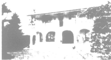
PRIVACY IN THE TREES

This nine room detached home on a quiet court gives you a safe area for your children to play. It has a main floor family room with fireplace and walk-out, also a main floor laundry room, very large eat-in kitchen, four bedrooms, two full washrooms, and one 2 piece washroom. Bright living and dining rooms. Large foyer at the entrance with a majestic oak spiral staircase. To view call Mills Carson, 279-5652.