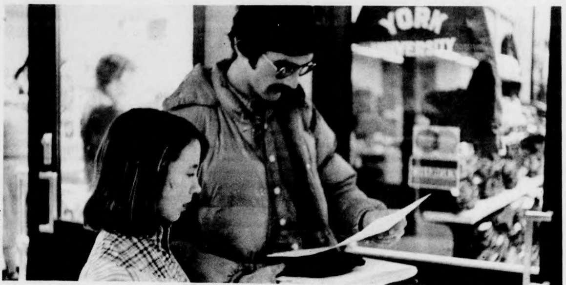
Yorkite gets nailed by little litter fighter.

By the way, on the chance that one of these dedicated individuals hasn't already nailed you, they will be in Central Square again today, around noon.