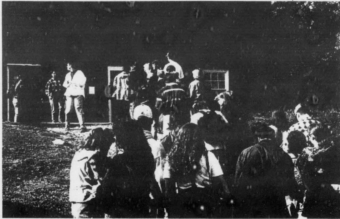
Kissing their money good bye. These students are feeling the financial crush of buying texts

"Prices in January 1995 are at the same level as they were in 1988," said