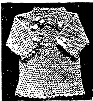
FIGURE NO. 4.—INFANTS' CROCHETED SHIRT.

FIGURE NO. 4.—The materials required are: \frac{3}{4} laps of white