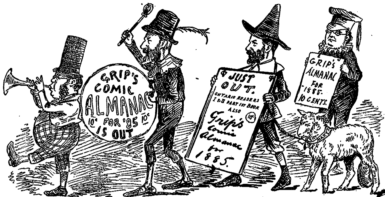
MR. GRIP'S ANNUAL PARADE.

MACHINE OILS { Four Medals and Three Diplomas awarded at Leading Exhibitions in 1881 } McCOLL BROS. & CO., TORONTO.