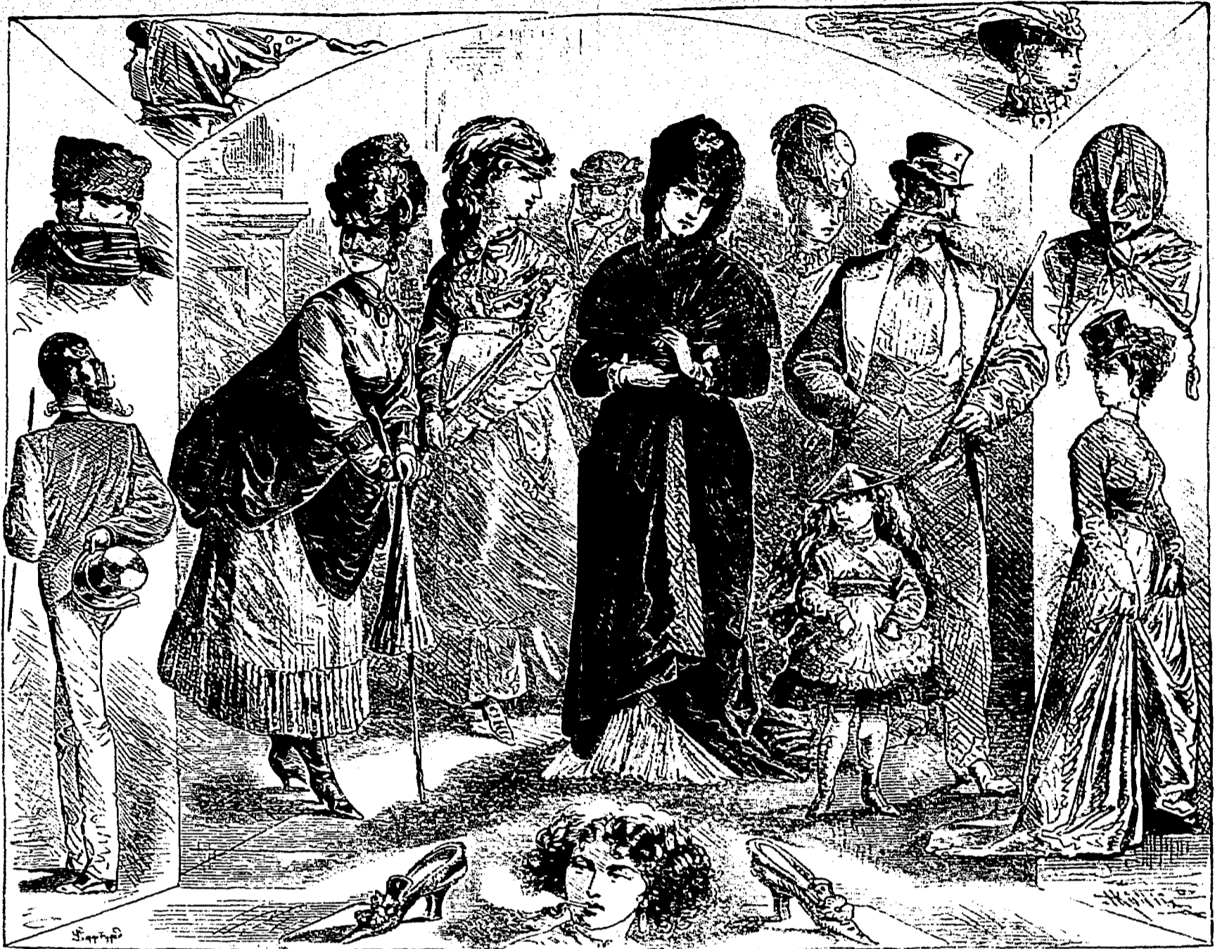
THE FASHIONS OF THE PERIOD.

GRANT'S SKIN PRESERVER. BEAUTIFUL FOR EVER.—For sale at all Drug Stores. Price 25 cents. ELLIOT'S DENTIFRICE.—THE BEST IN USE.—The verdict of 30 years' trial. All Druggists sell it