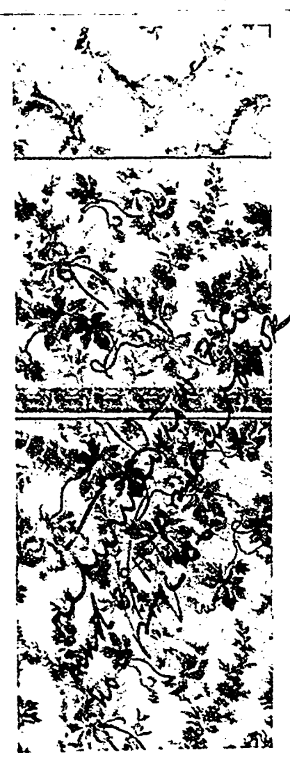
No. 1020 - The Watson, Foster Co., Limited.

HERE is another new disease, says Pearson's London Magazine, and this time it has no connection with microbes of any sort. It is the wall paper disease, though that is not the scientific name of it. The discoverer is an American physician,