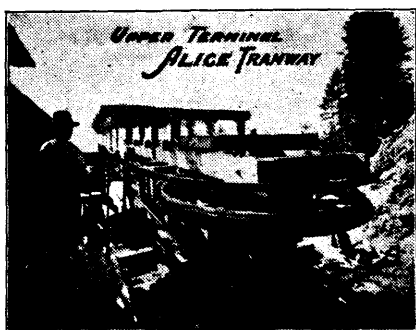
Upper Terminal, Alice Tramway.