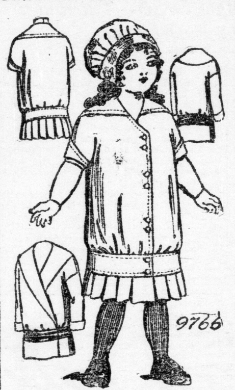
9766—A Charming Outfit for Miss

Doll's Set, comprising a Balkan Dress, a Coat, and a "Billie Burke" Bonnet. Even the little "play-mother" may have her children dressed in the "latest fashion." The styles here shown are easily developed, and suitable for any of the dainty materials used for doll's clothing. Cloth, silk, or velvet may serve for either coat and dress, and for the latter, linen, flannel, lawn, or percale is also appropriate. The bonnet could be of lawn, silk, plush or velvet as desired. The pattern includes all styles illustrated, and is cut in 8 sizes: For dolls—14, 16, 18, 20, 22 and 24 inches in height. It requires 1/2 yard of 24-inch material for the cap, 1 1/2 yards for the dress, and 1 2-8 yards for the coat of an 18-inch size.