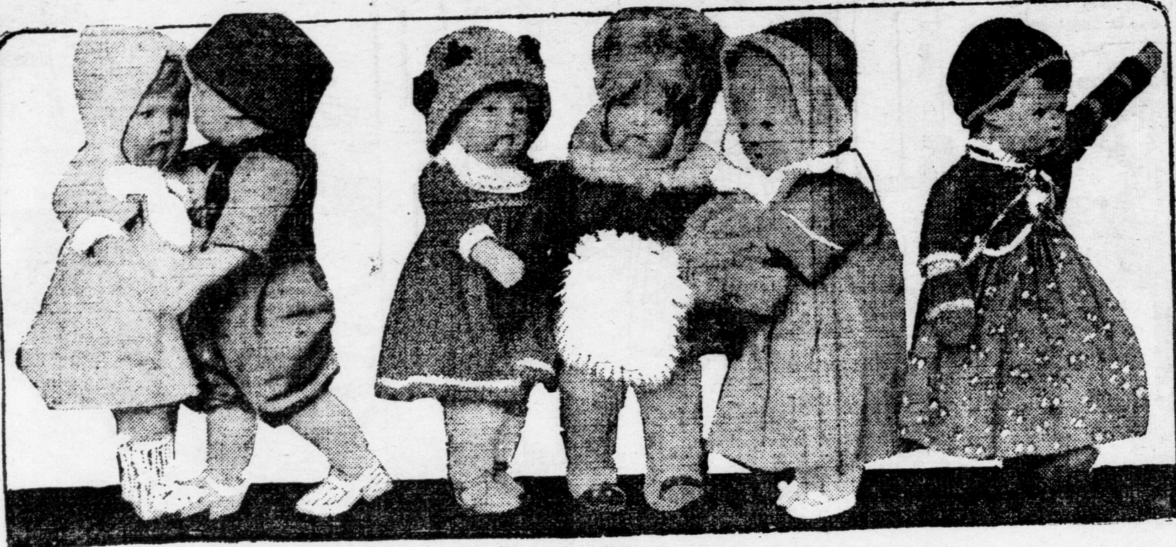
Some of Mother Kruse's Wonderful, Almost-Human Dolls, Which Are the Sensation of This Year's Christmas Toys.

Almost-Human Dolls, That Come From Dear "Mother Kruse" In Far-Off Germany, Are the Sensation of the Christmas Season!