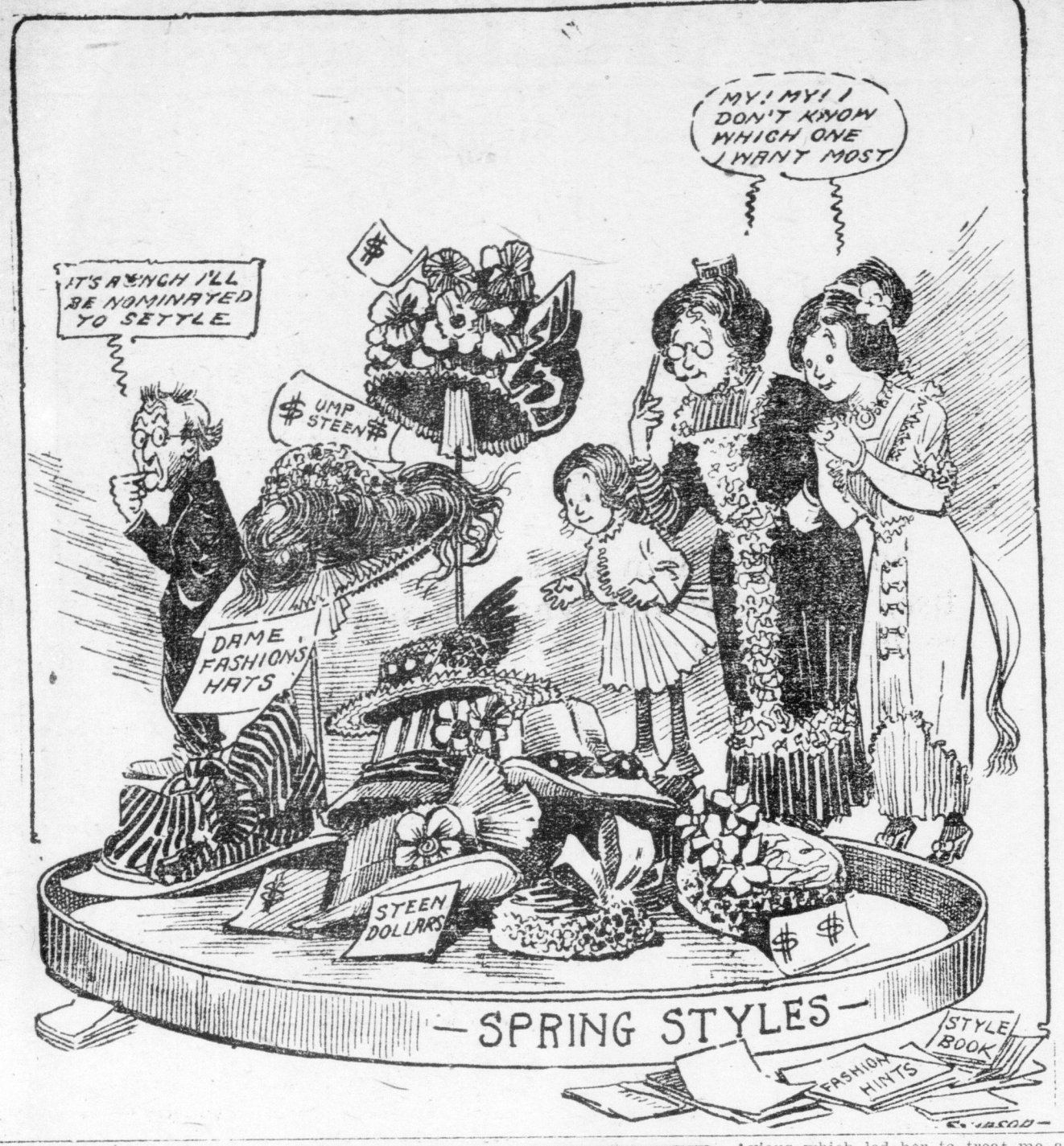
— SPRING STYLES —