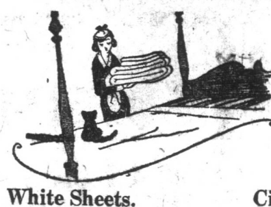
Table and Bed Linens

Everything possible has been done to assist the public in availing themselves easily, freely and profitably, of what is undoubtedly one of the best value-giving events of the year.