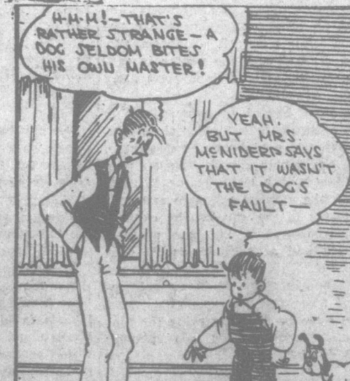
FIGURE THAT SAYS TH' DOG DIDN'T KNOW WHO HE