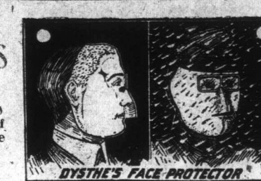
AFRAID OF NO STORM FACE THE STORM AS THROUGH A WINDOW.

treasury, and the balance peoled for one year.