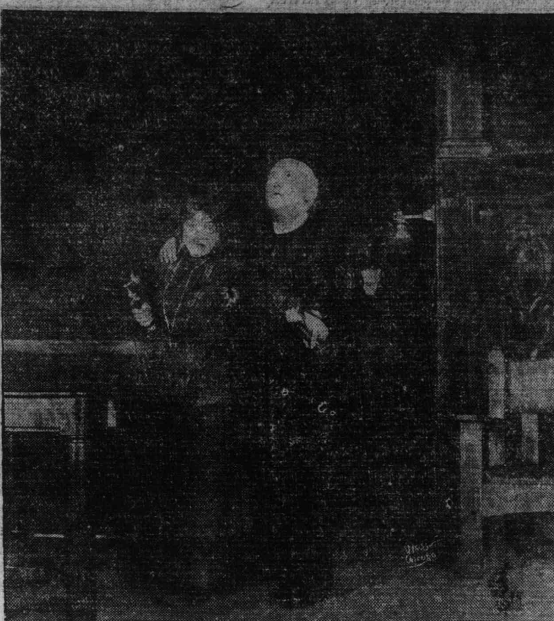
Scene from "The Rosary" coming to the Grand Opera House, Thursday night, May 1st.

Wood's Phosphodina. The Great English Remedy Tones and invigorates the whole person system, makes new blood in old veins, cures Nervous Debility, Mental and Irregularities, Loss of Energy, Palpitation of the Heart, Badly Memory, Price $1 per box, six for $5. One will please, six will cure. Sold by all druggists or mailed in plain box on receipt of price. New pamphlet mailed free. THE WOOD MEDICINE CO., TORONTO, ONT. (Twenty Years)