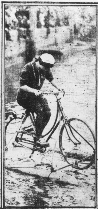
The Start from Richmond.

This is the Folkstone girl who recently attempted to cycle the channel on the afternoon of the 25th. She rode her water cycle fifteen miles to the Temple from Richmond-on-the-Thames.