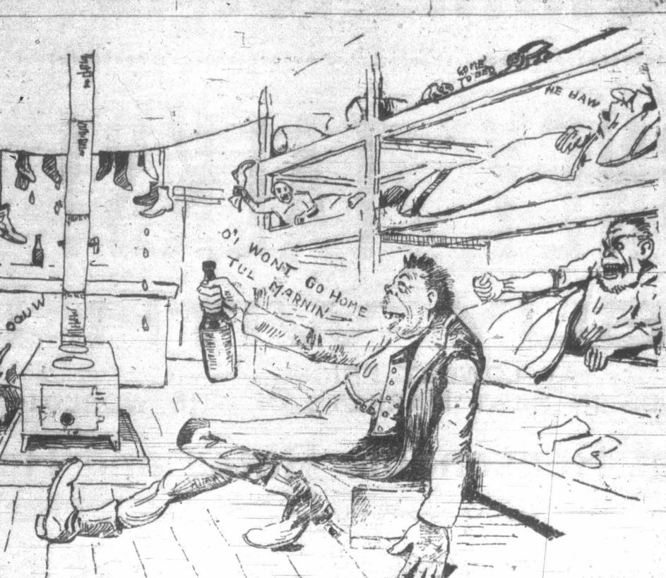
OI'M THE MOST POPULAR - MAN ON HOONKER.

more than two or three hundred vards. "Then the Doc, who was more ex- for a few minutes the song would die when we togeather lovers were