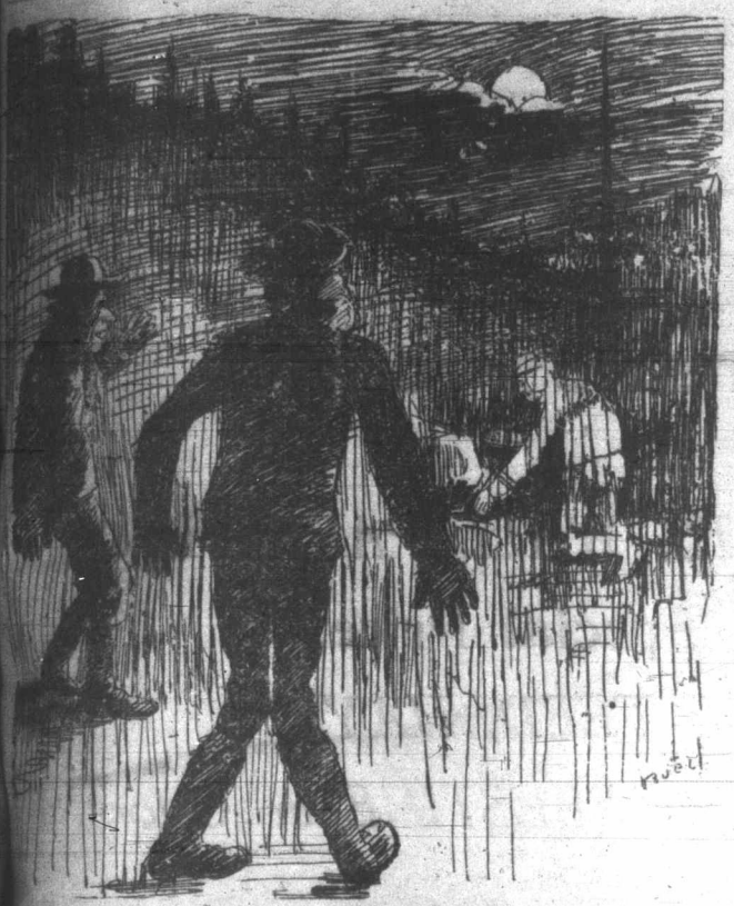
THEY GAZED ON O'BRIEN'S GHOST

of ashore from the scow, and with Cariboo.