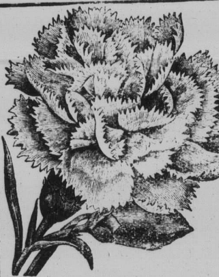
Giant Flowering Carnation

A. B. SHUBERT, Inc. Dept. C417, CHICAGO, U.S.A.