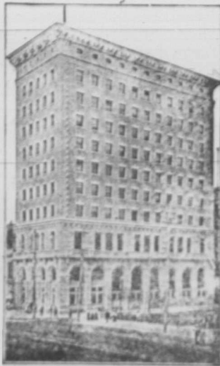
Union Bank Building, Winnipeg