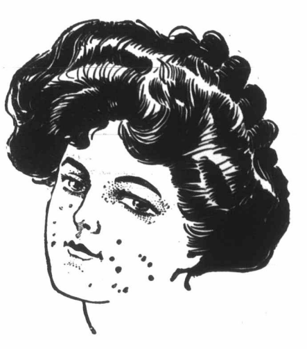
Don't Mar Your Beauty by Neglect. Stuart's Calcium Wafers Sent Free for Trial.

There is absolutely no necessity for this condition b ing so exceedingly prevalent. Pimples and skin troubles show that the blood is impure, and is forcing its impuri ies into the cells and glands of the skin, there festering and braking out a last into many enuptive disor lers.