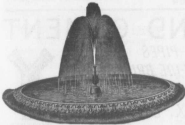
Design No. 1007.

Very Neat and Artistic For Man and Beast.