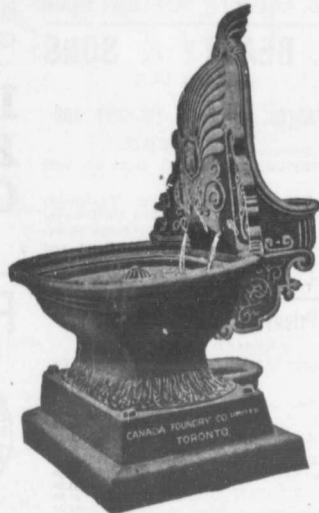
Design No. 1010

Very Neat and Artistic For Man and Beast.