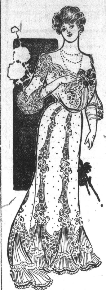
GOWN OF WHITE AND SILVER.

Loose Coats—Silk Fringe For Trimming—Pale Shades. Tucked silk and chiffon with stitchery between corded lines and spaced tucks are all used for tea or coffee coats with chiffon frills or flounces of lace. White and cream tones, together with all the pale shades, are the rage for southern wear. As the days become warmer we shall see a great deal of alpaca and serge.