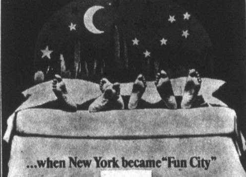
...when New York became "Fun City"

"Where Were YOU When The Lights Went Out?"