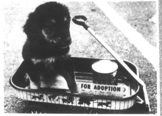
This little German Shepherd puppy is "ready to go" to any good home in Mississauga. The nine-week-old female has no name yet but that will be up to her new "parents" to decide. This puppy and many more are waiting to be adopted at the Ontario Humane Society Shelter on Mavis Rd.

The three points dealt with Bell arriving at and submitting to council reasons "to be considered in arriving at a fair rate