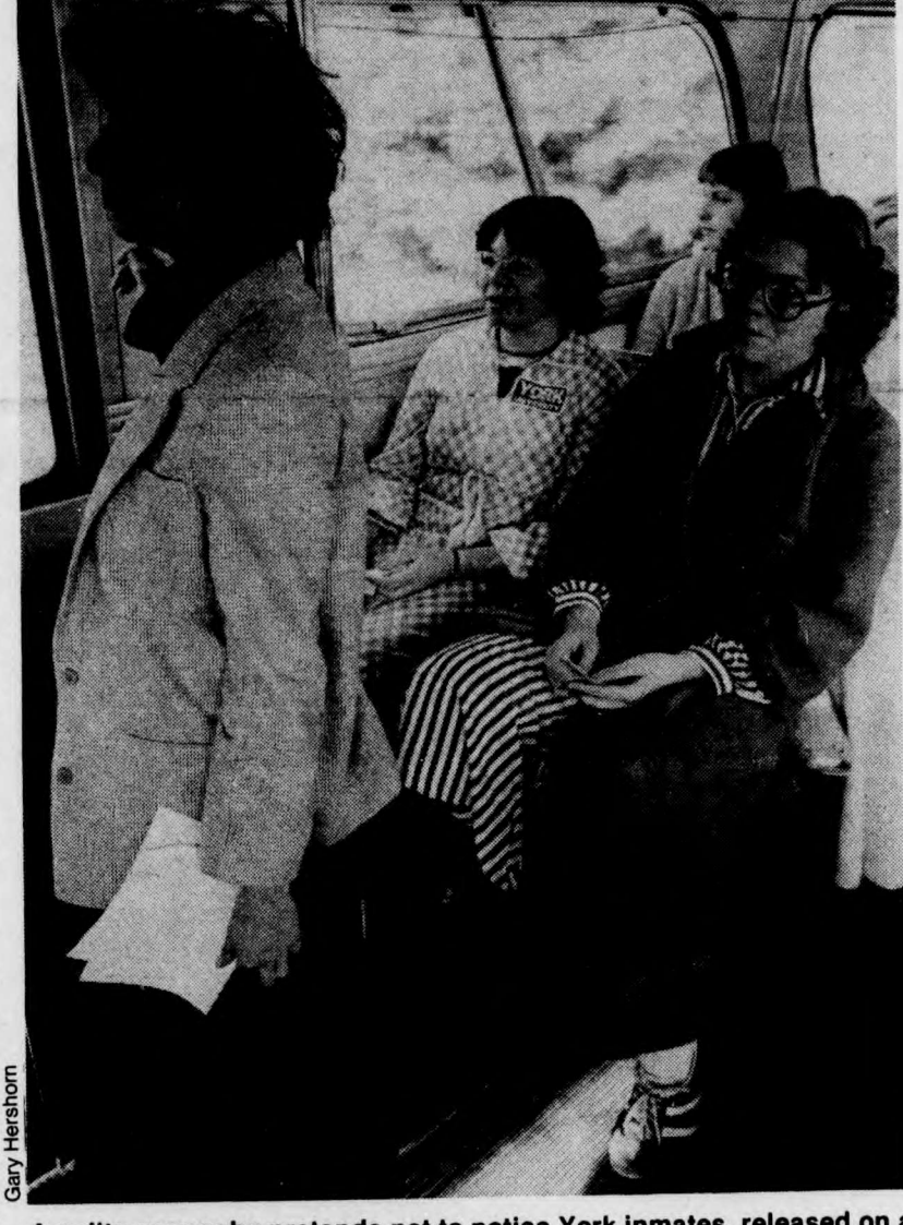
A polite passer-by pretends not to notice York inmates, released on a new program of weekend passes for good behavior. The pyjama hunt on the TTC was part of the "wild and crazy" Rill Olympics (see pg.6)