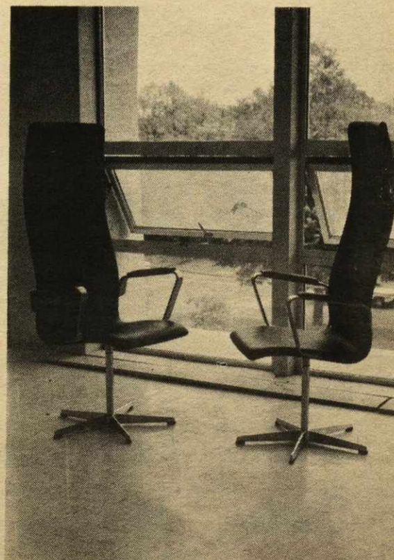
These elegant chairs are awfully uncomfortable, but were bought, perhaps, because they look terribly sexy.

Continue out the fire doors and take the main stairs up to the Fifth Floor.