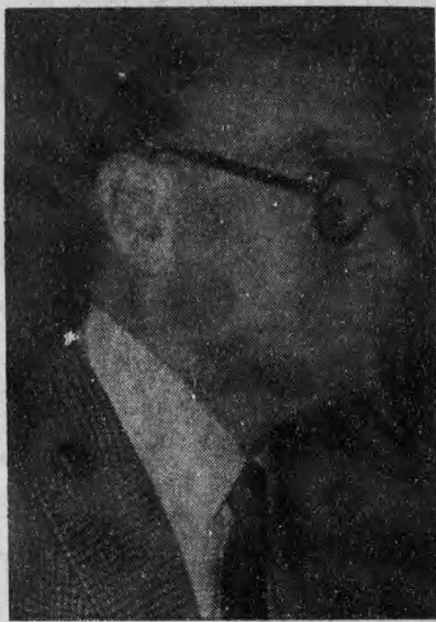
Sir John Rothenstein