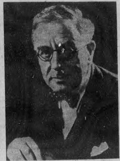
Mr. A. J. P. Taylor