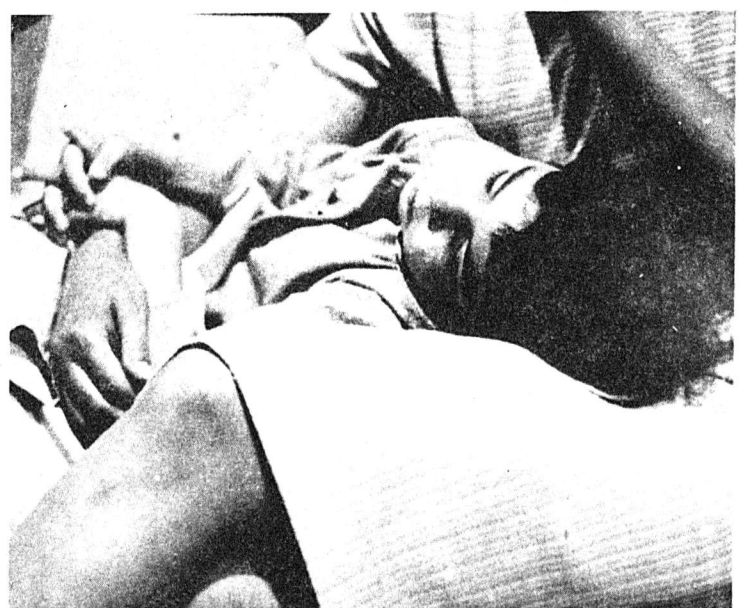
WHILE THE TRAVELLERS PERFORMED . . . a child slept

To meet as many Canadians as possible through real, honest folk music of their own native Canada, self-taught as well as music from other lands —for this the Travellers aim.