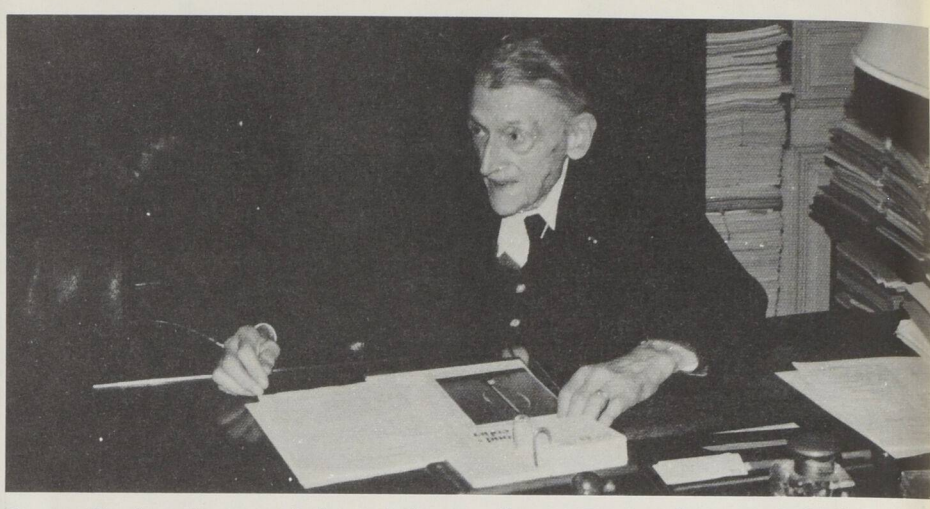
Georges Darrieus, inventor of the vertical axis turbine, in his Paris study.

The fallen wind turbine was the largest and most powerful of its kind ever built: in strong winds, it could generate 230 kW of electrical power — enough in theory to satisfy the needs of approximately 50 average households, provided none used electric space heating. When the wind was not blowing, all the power needs of the 13,000 islanders were supplied by burning diesel fuel, shipped at considerable expense from the mainland. When the wind blew, some fuel was saved, for wind energy was converted into electri-