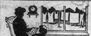
The satisfaction of having the washing done early in the day, and well done, belongs to every user of Sunlight Soap.