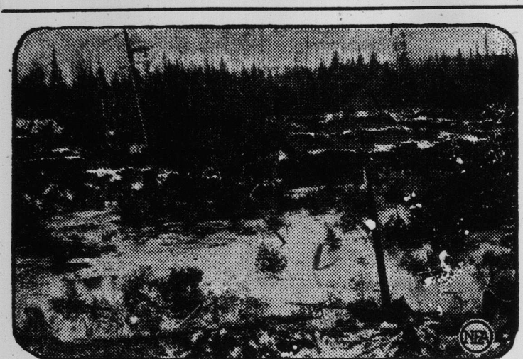
burst through walls of the Barnes-Hecker iron mine at Ishpeming, Mich., a quarter of a mile distant, and drowned 51 men. Banks around the