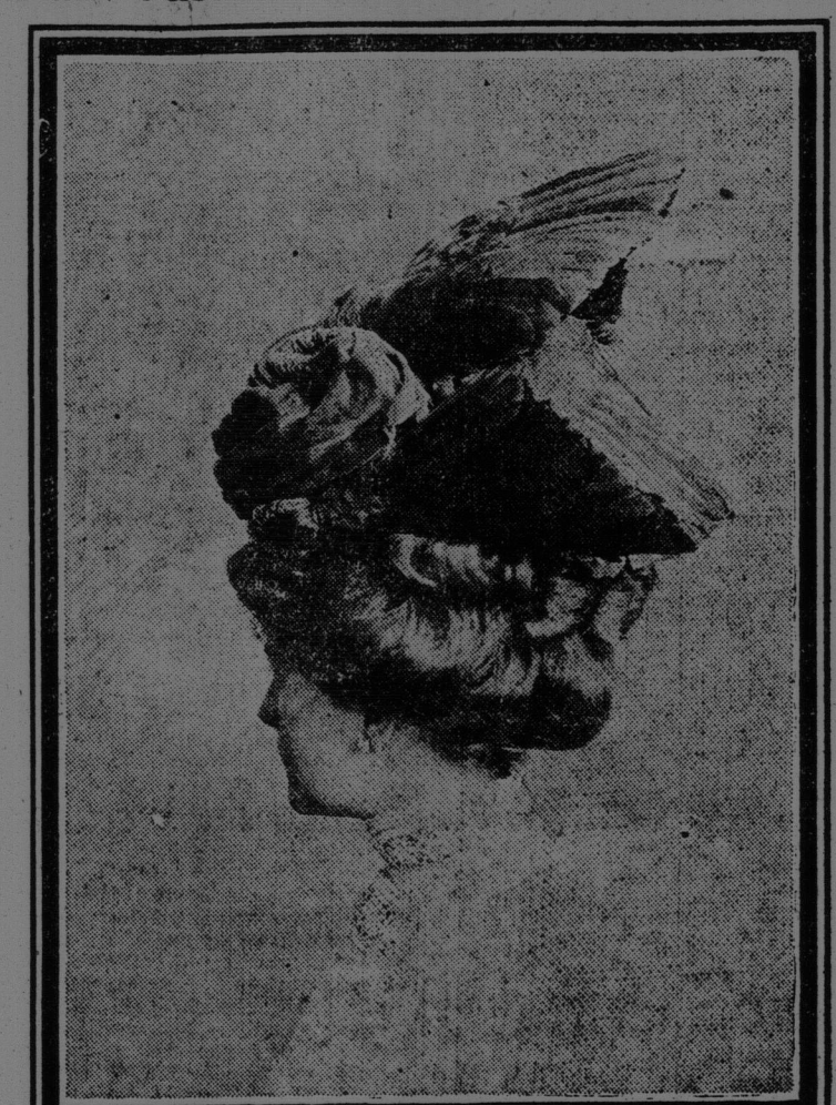
SMALL TOQUE TRIMMED WITH HUGE WINGS There are many occasions for which the and there are many women who find it small toque is the most appropriate hat, the most becoming of all headwear. For leased.

line to the hat, one pair being placed at THOUGHT STRYCHNINE