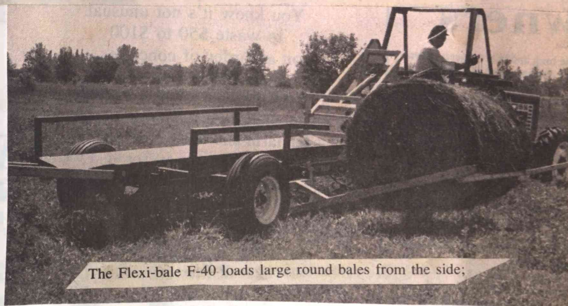
The Flexi-bale F-40 loads large round bales from the side;

The maker of a new round bale handler claims his machine turns haymaking into a one-man operation.