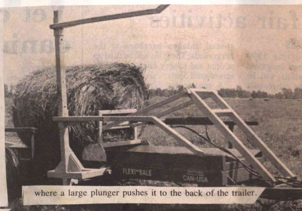
where a large plunger pushes it to the back of the trailer.