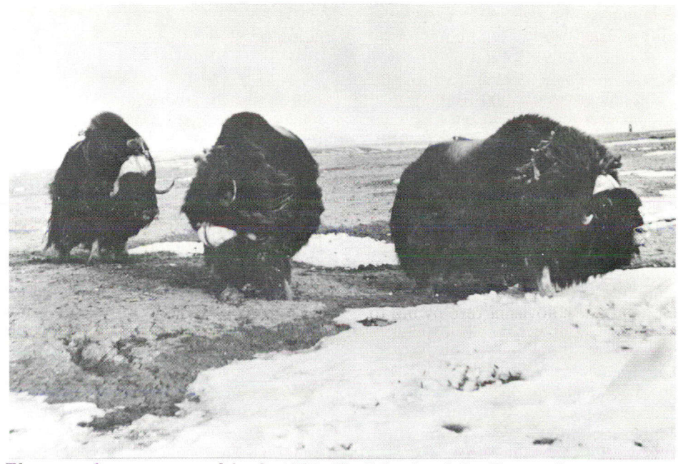
These muskoxen appeared in the NFB film Islands of the Frozen Sea.

The Old World species became extinct in Europe following the disappearance of the continental glaciers, though there is, however, evidence that muskoxen may have existed in