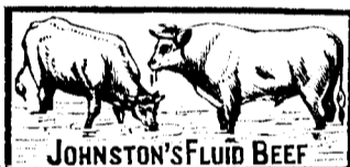
JOHNSTON'S FLUID BEEF

ALL THE FLESH-FORMING and strength-giving elements of Prime Beef are supplied by