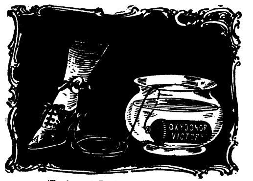
(Trade-mark Registered Nov. 24, 1896.)