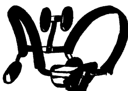
ABDOMINAL AND SPINAL (SHOULDER AND LUNG BRACE.