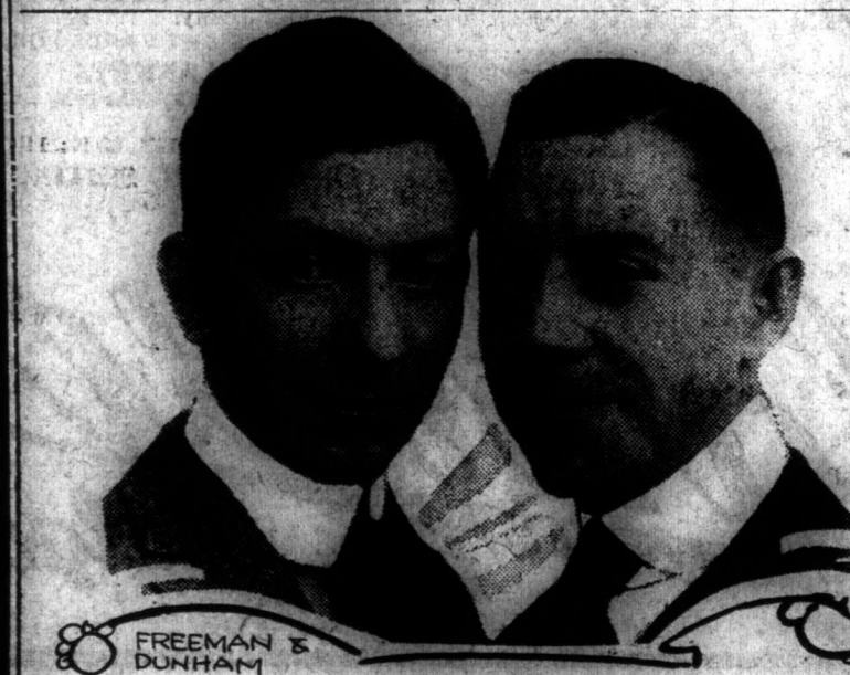
AT PANTAGES NEXT WEEK

guerite Clark photoplay booked to play at this theatre shortly, and is one of the biggest attractions ever produced by the Famous Players company.