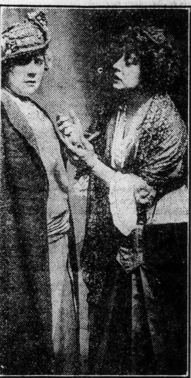
"Give me my child!"

Summoning the servants, Esther had Hagar carried to her chamber. The