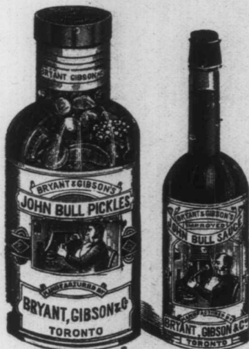
This is a facsimile of our bottles.

BRYANT, GIBSON & Co., TORONTO, Manufacturers of