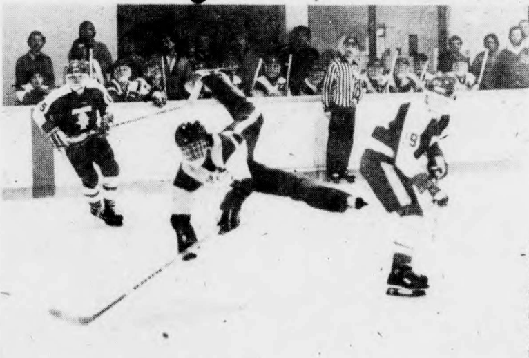
Those daring young men in their flying Cooperalls