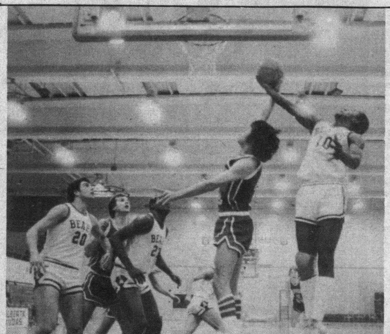
Hey! Guess what? The Bears won their first b'ball game of the year. It was only exhibition but a win's a win, right?

This would require major renovations to the kitchen and seating area, especially if a liquor licence came through. Yet all this will depend on the construction of the meeting rooms and club offices in the basement to replace the areas by the loading-dock.