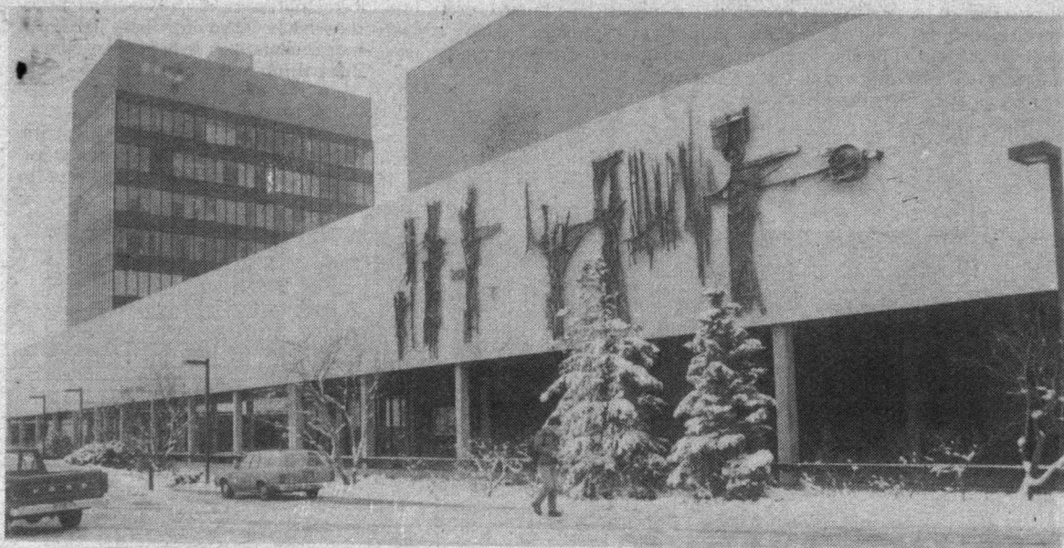
The Students' Union Building (your building) is going to become a high security, low access centre during the Uni-games.