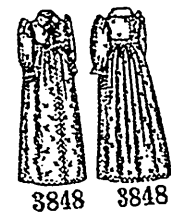
Infants' Short Wrapper (Copyright). One size: Price, 10d. or 20 cents.