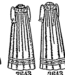
Infants' Dress (Copyright). One size: Price, 10d. or 20 cents.