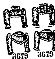
Infants' Dress Yokes and Sleeves (Copyright). One size: Price, 5d. or 10 cents.