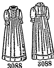
Infants' Dress (Copyright). One size: Price, 10d. or 20 cents.