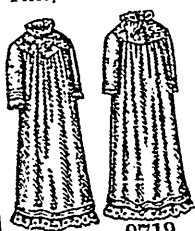
Infants' Dress, with Seamless, Pointed Yoke. One size: Price, 7d. or 15 cents.