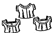
Infants' Shirts. One size: Price, 5d. or 10 cents.