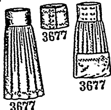
Infants' Pinning-Blanket and Flannel Band. One size: Price, 7d. or 15 cents.