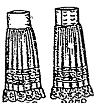
Infants' Skirt. One size: Price, 7d. or 15 cents.