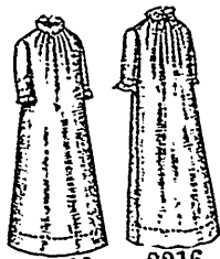
Infants' Slip. One size: Price, 7d. or 15 cents.