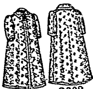
Infants' Tufted Wrapper or Bath Robe (Copyright). One size: Price, 10d. or 20 cents.