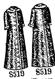
Infants' Wrapper. One size: Price, 10d. or 20 cents.