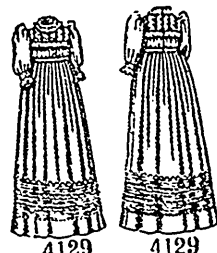
Infants' Dress (Copyright). One size: Price, 10d. or 20 cents.