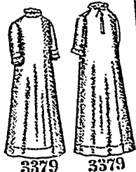
Infants' Night-Gown (Copyright). One size: Price, 7d. or 15 cents.