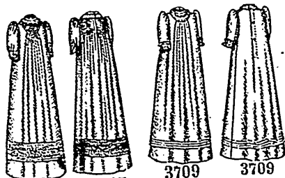
Infants' Dress (Copyright). One size: Price, 10d. or 20 cents.