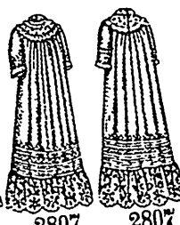
Infants' Dress (Copyright). One size: Price, 10d. or 20 cents.