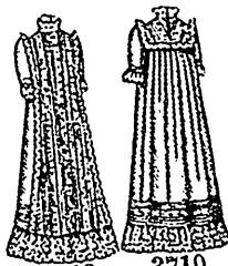
Infants' High-Necked Robe (Copyright). One size: Price, 10d. or 20 cents.