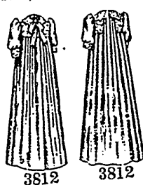
Infants' Cloak (Copyright). One size: Price, 10d. or 20 cents.