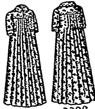
Infants' Wrapper (Copyright). One size: Price, 10d. or 20 cents.