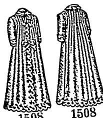
Infants' Wrapper. One size: Price, 10d. or 20 cents.