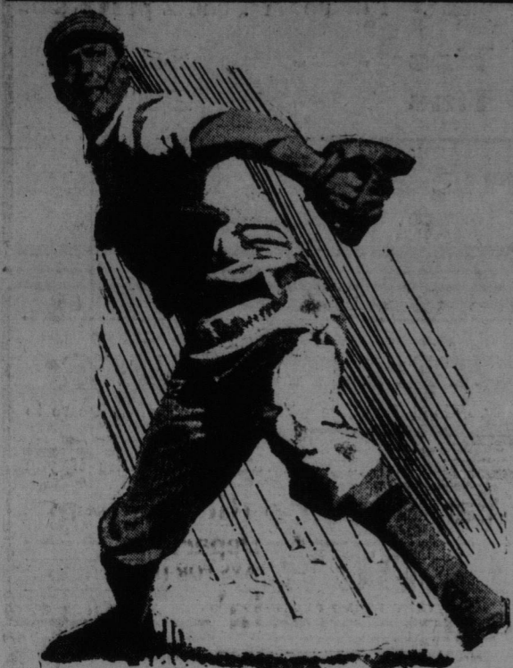
Former St. John Pitcher, in Box for Athletics Yesterday, Was Very Erratic but Had Bunches of Luck

Philadelphia, Oct. 18.—In a game that was full of thrills from the start almost to the finish, the Philadelphia American league champions this afternoon administered a crushing defeat to the Chicago National League champions before more than 24,000 persons. The score was 9 to 3. It was one of the most exciting games ever played on the American league grounds in this city. It abounded in sensational fielding and terrific batting and the big, perspiring crowd was frequently brought to its feet with wild enthusiasm as player after player made some brilliant stop or throw, or lined out a smashing hit into the crowd.