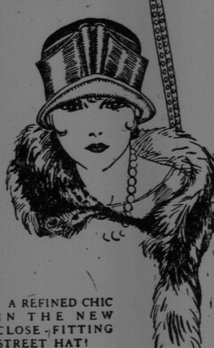
A REFINED CHIC IN THE NEW CLOSE-FITTING STREET HAT!

specializes in hats that are "different"—and attractive originality which sets them in a class apart.