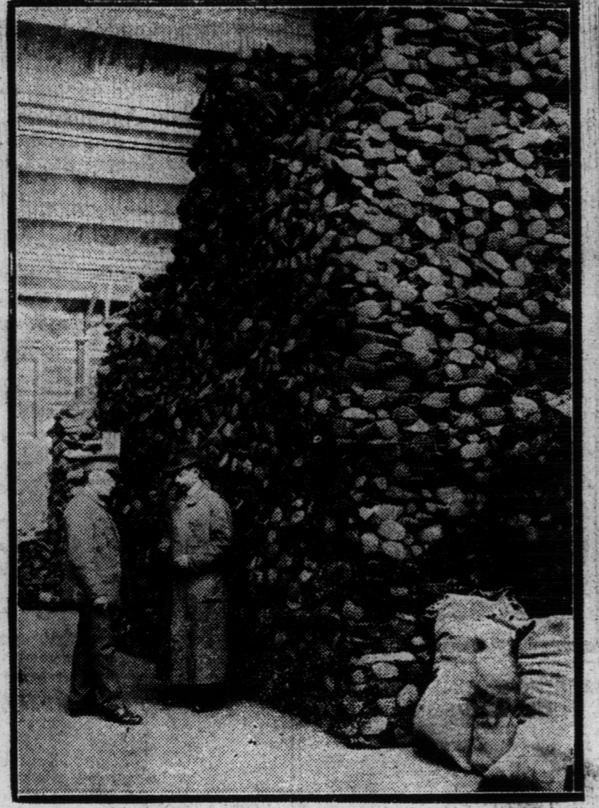
A MOUNTAIN OF WAR BOOTS Germany has tons and tons of war material, which has to be put to some good purpose. The photograph shows one of many stacks of military boots now stored in Berlin, and which will have to be got rid of.

Says It is Constitutional Party Run on Constitutional Lines. REPLIES TO PREMIER London, April 1.—Arthur Henderson, labor leader, takes issue with Lloyd George on his statement that the labor of communism is affecting the British Labor party, and that it is not fit to assume the reins of government.